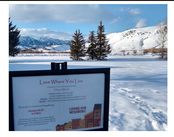
Above: SMLC has been hosting a "Love Where You Live" series on Monday nights at 5:30 pm.

Below: Pastor oversees the quilters as they finish up the last of the quilts that will be driven to Indiana and then shipped to third world countries through the Lutheran World Relief program.