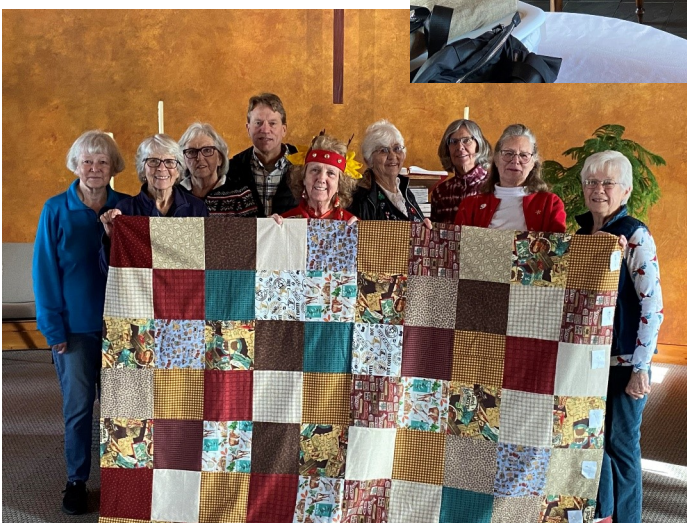
Left: The Quilt Group show off one of the many quilts that they made for Lutheran World Relief. The finished quilts get shipped around the world to help those in need.